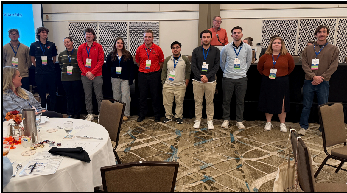
Illinois State University business education students received the Dora J Beattie Conference Scholarship.