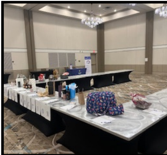
The Silent Auction table was full of fabulous goodies!